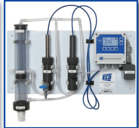
Model CD80 Chlorine Dioxide Analyzer