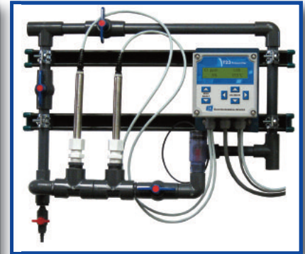
Model DCA-23 Seawater Chlorination Dechlorination Analyzer