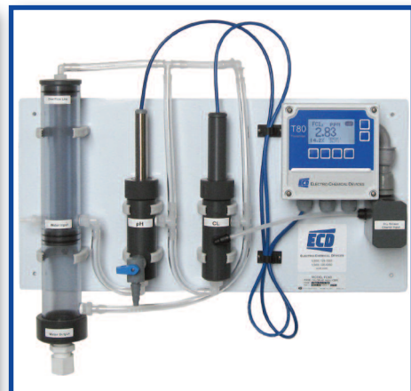
Model FC80 Free Chlorine Analyzer